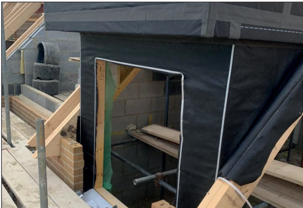
Fully Designed & Engineered

Dormers enhance a 'Room in Roof' design and create additional full height space – we offer a standard prefabricated or bespoke dormer solution to ensure quality, enhance speed of build and reduce working at height. An insulated dormer built offsite as part of your total roof solution from Crendon. All dormers are fully engineered to your design and supplied to site either as a 'kit' or 'complete' ready to install.