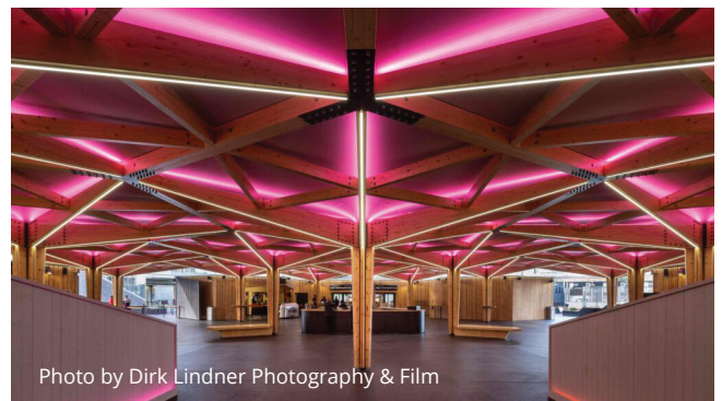
Structure showcasing the extensive use of Glulam and CLT

The dome shaped roof structure is made up of 270 triangular cassettes, spanning between 0.5m and 12.00m. These were manufactured using I Joists, OSB, mineral wool insulation and acoustic separation foam, washers and fixings.