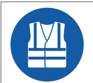
Hi Vis Wear