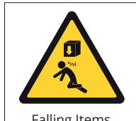
Falling Items from Above