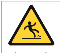
Slip, Trip, Falls