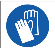
Hand Protection Gloves can be removed to untie/tie rope knots