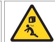
Falling Items from Above