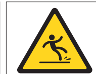
Slip, Trip, Falls